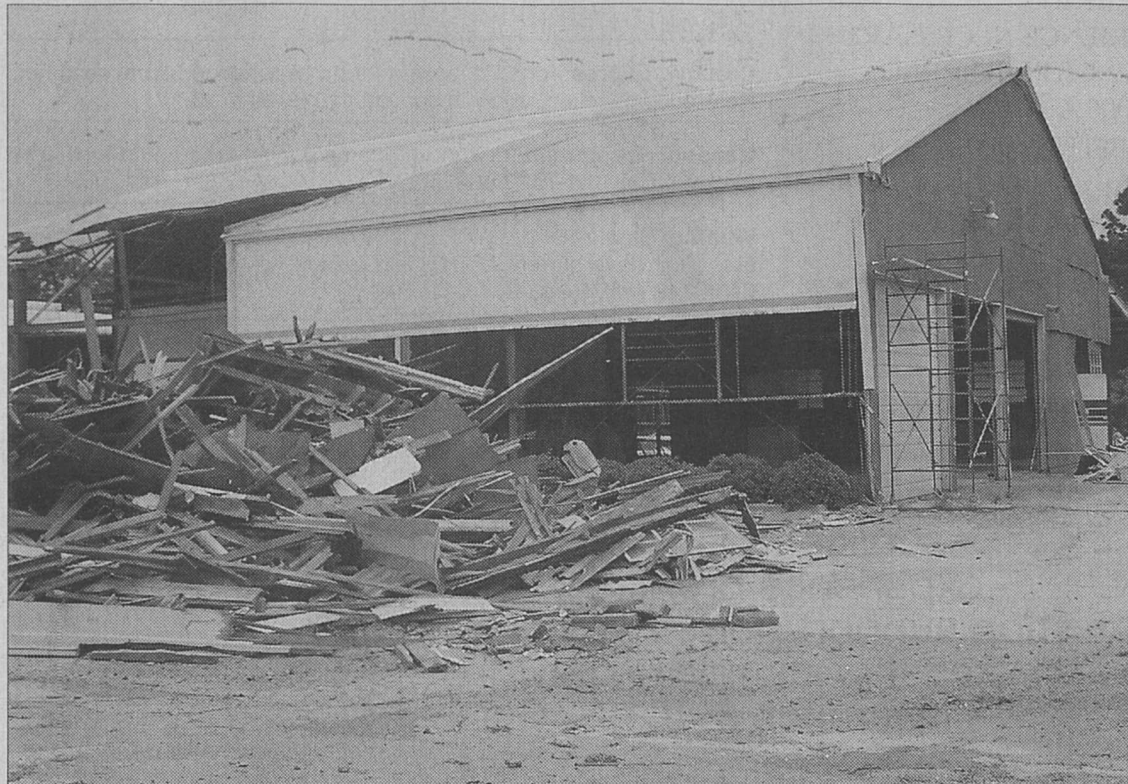
The old Lake Motors building is being renovated and will reopen this summer as a location for Purvis Industries. This picture was taken May 1.