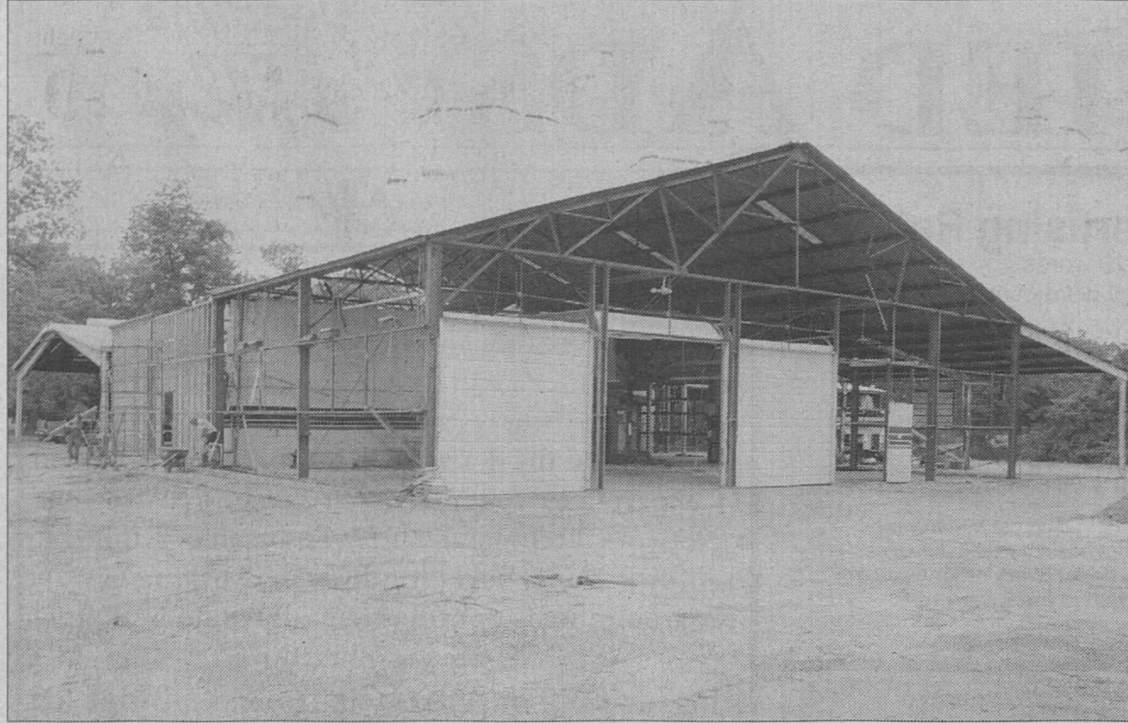
Renovations continue to Purvis Industries 30 th branch which will be located in the old Lake Motors building on S. McCarty. A spokes person said they would be looking to open at the end of July, with a staff of three to four people to start with. The facility will have an inventory of bearings, power transmissions, belting and gearboxes to service their clients. Above picture taken May 8.